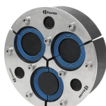
H3 UG™ seal

For detailed information, please visit roxtec.com .